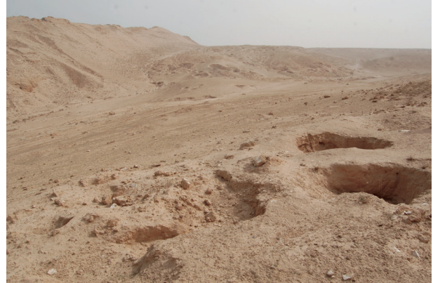
Figure 3: Looted MB tombs in front and Tell Jezla (23H) seen in the middle. Top left is the Jezla fortress, looking southeast.