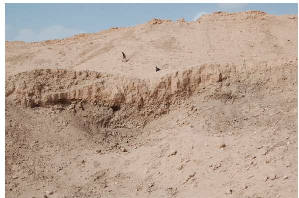
Figure 5: Thick ash deposit exposed at the 23CG mound in Jezla, looking north. Farther side is the Jezla fortress.