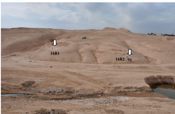
Figure 6: Locations of test trenches at Area 16R on the west bank of Wadi Kharar, looking west.