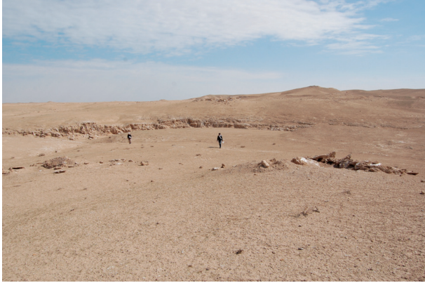
Figure 2: Burial cairns at the western side of Wadi Beilune seen in the middle, looking east.

were also collected. Tentative observations of the lithic assemblages date them to Upper Palaeolithic (Fig. 7), but further analyses are necessary to specify technological characteristics.