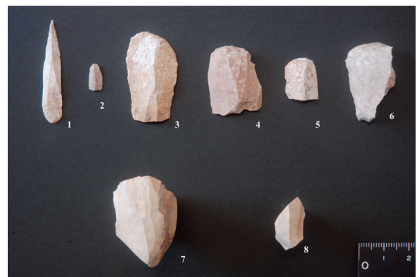
Figure 7: Upper Palaeolithic artifacts from 16R1. 1: el-Wad point, 2: Bladelet with Ouchtata retouch, 3-5: End scrapers, 6: Laterally carinated scraper, 7-8: Bladelet cores.